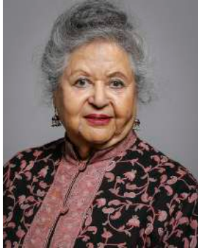
The Right Honourable The Baroness Shreela Flather, DL Patron of The Women's Council and Honorary Vice President 13 February 1934 - 6 February 2024 (aged 89)

It is with great sadness that we inform you of the death of Baroness Shreela Flather DL. Her active support for The Women's Council and its aims were steadfast and she was a generous sponsor for us with events at the House of Lords for more than 20 years. It was also her inspiration for the setting up of the Joint Commonwealth Organisation. May her memory live on in the hearts and minds of her friends, colleagues and admirers.